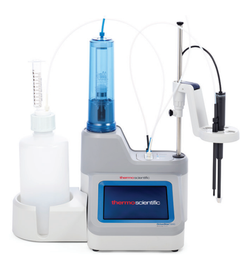
Orion Star T930 ISE Titrator with 20 mL burette