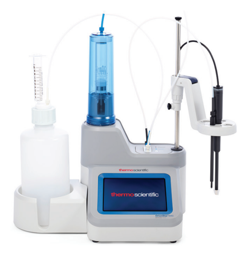
Orion Star T930 ISE Titrator with 20 mL burette