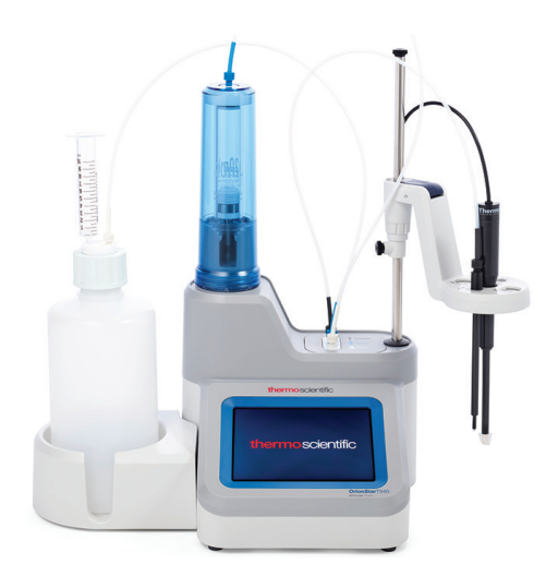
Orion Star T930 ISE Titrator with 20 mL burette