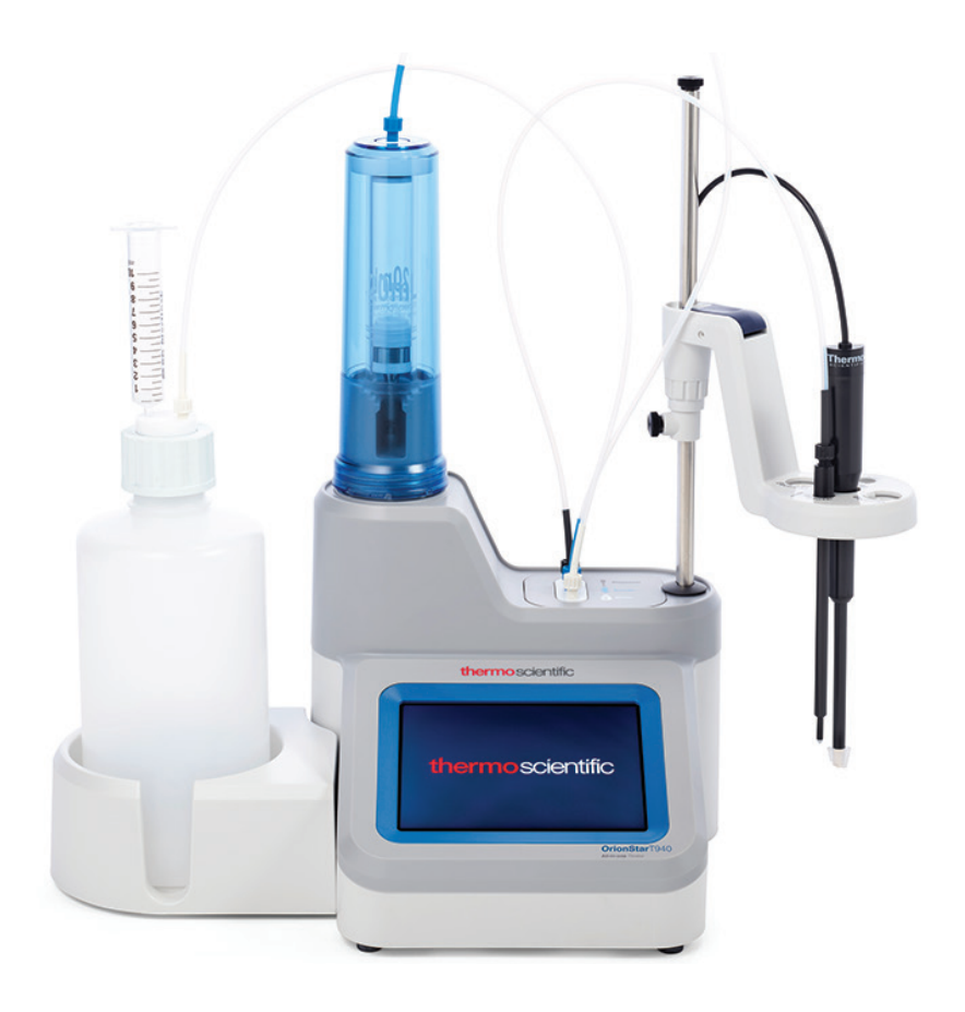
Orion Star T930 ISE Titrator with 20 mL burette